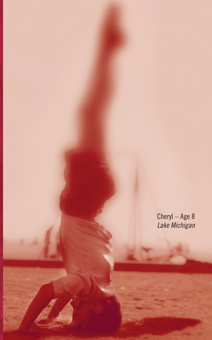
Cheryl – Age 8 Lake Michigan

TRY A DIFFERENT PERSPECTIVE... TURN YOUR NEXT EVENT UPSIDE DOWN!